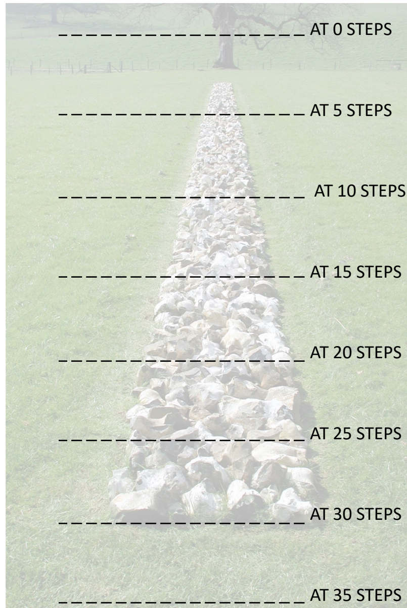
Richard Long, Tame Buzzard Line , 2001

Activity — Walk Tame Buzzard Line and write your own 'text work' based on what you can see along your journey!