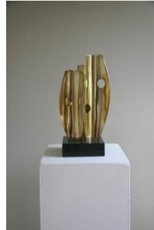
Barbara Hepworth Four Forms , 1974 Brass 34 x 21 x 21 cm 1ft 1 \frac{1}{2} x 8 \frac{1}{4} x 8 \frac{1}{4} in. Cast 0 from an edition of 9