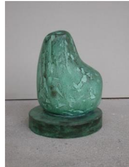
Barbara Hepworth Bird Form , 1963 Bronze 36 x 26 x 27 cm 1ft 2 x 10 x 11 in. Edition 7 of 9