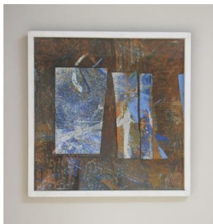
Ian Stephenson Progressive plane: blue 59 , 1959 Painted collage on board Framed: 60.5 x 60 x 2 cm 1ft 11 \frac{7}{8} x 1ft 11 \frac{5}{8} x \frac{3}{4} in.