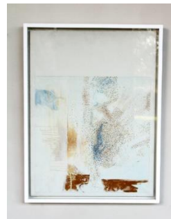
Ian Stephenson Blue Shadow: Giusti I , 1960 Oil on canvas Artwork: 101.6 x 76.2 cm 3ft 4 x 2ft 6 in. Frame: 108.5 x 83 x 4.5 cm 3ft 6 \frac{3}{4} x 2ft 8 \frac{3}{4} x 1 \frac{3}{4} in.

To enquire, please contact the Gallery at nac@sculpture.uk.com or call +44 (0)1980 862244