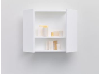
Edmund de Waal out of this same light III , 2021 porcelain, gold, alabaster and wood 43.6 x 38 x 16 cm 1ft 5 \frac{1}{10} x 1ft 2 \frac{9}{10} x 6 \frac{1}{8} in.

Barbara Hepworth, John Hubbard, Ian Stephenson, Edmund de Waal