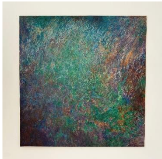
John Hubbard Atlas Landscape , 1972 Oil on canvas 190.5 x 182.9 cm 75 x 72 in.