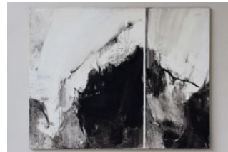
John Hubbard Black & White Double Landscape , 1964 Oil on canvas 139.5 x 177.5 cm 4ft 6 \frac{7}{8} x 5ft 9 \frac{7}{8} in.