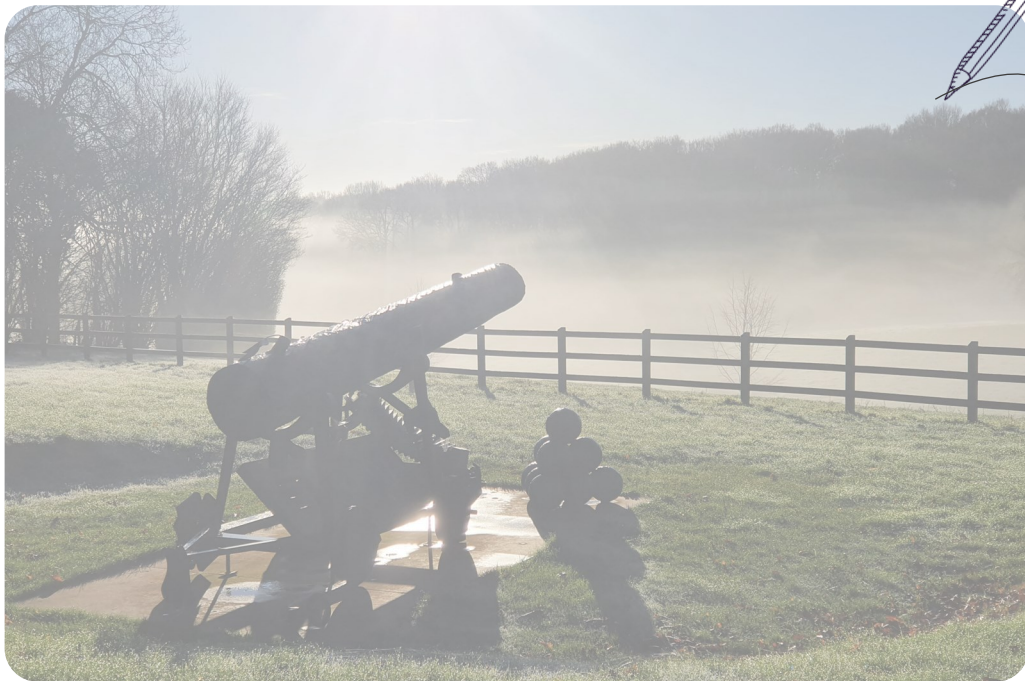
Bill Woodrow, Endeavour , 1994

Talking Point — What do you think the hidden message could be?